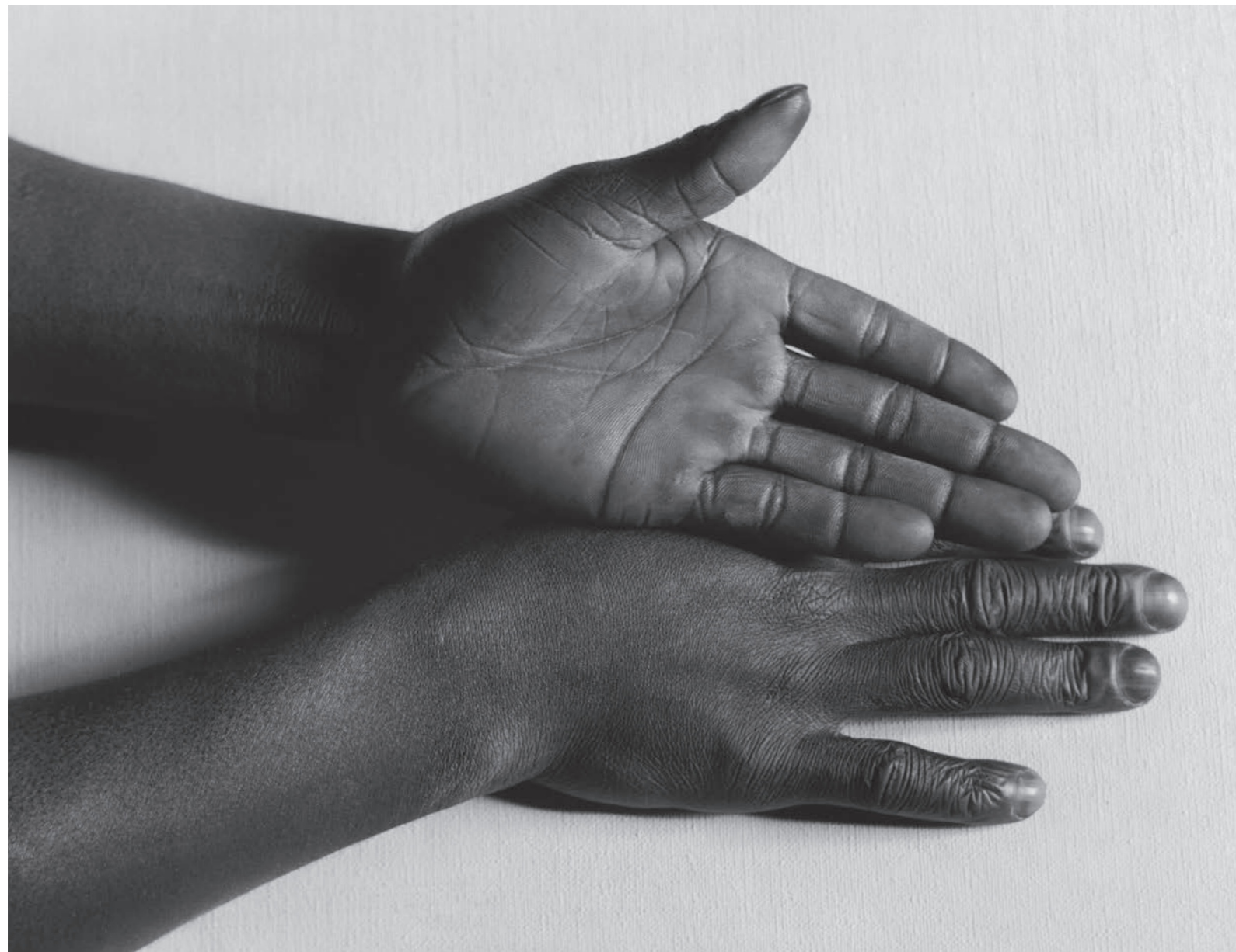
From left: Untitled (Hands); Untitled (Dan Dixon, Age 5); Untitled