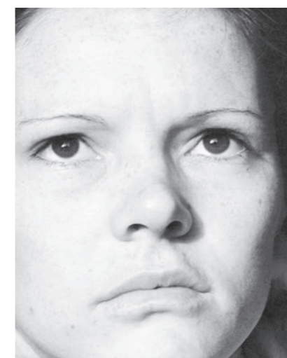
DOROTHEA LANGE (SAM CONTIS, FROM 'DAY SLEEPER' BY DOROTHEA LANGE AND SAM CONTIS, COURTESY OF MACK, © THE DOROTHEA LANGE COLLECTION, THE OAKLAND MUSEUM OF CALIFORNIA, GIFT OF PAUL S. TAYLOR, LIBRARY OF CONGRESS